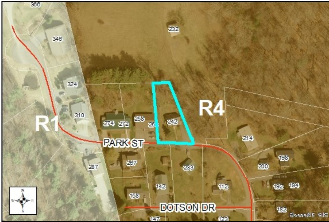
Slope, SFHA, Watershed, Corridor District