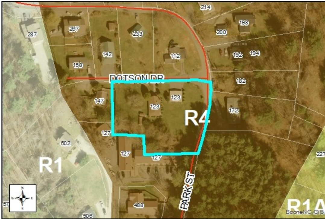
Slope, SFHA, Watershed, Corridor District