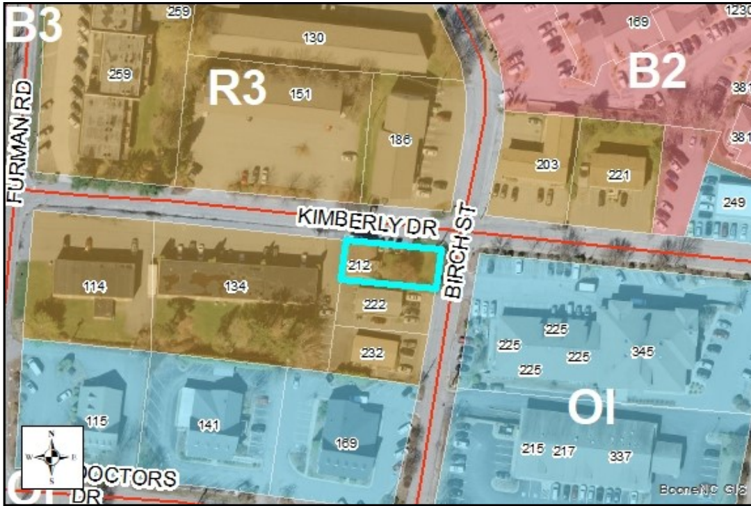
Slope, SFHA, Watershed, Corridor District