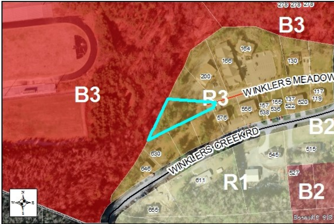
Slope, SFHA, Watershed, Corridor District