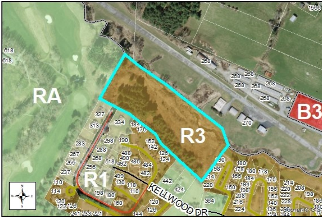
Slope, SFHA, Watershed, Corridor District