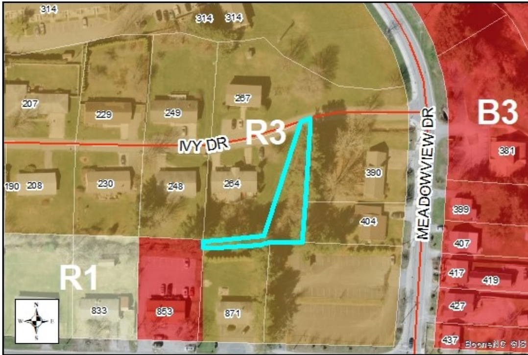
Slope, SFHA, Watershed, Corridor District