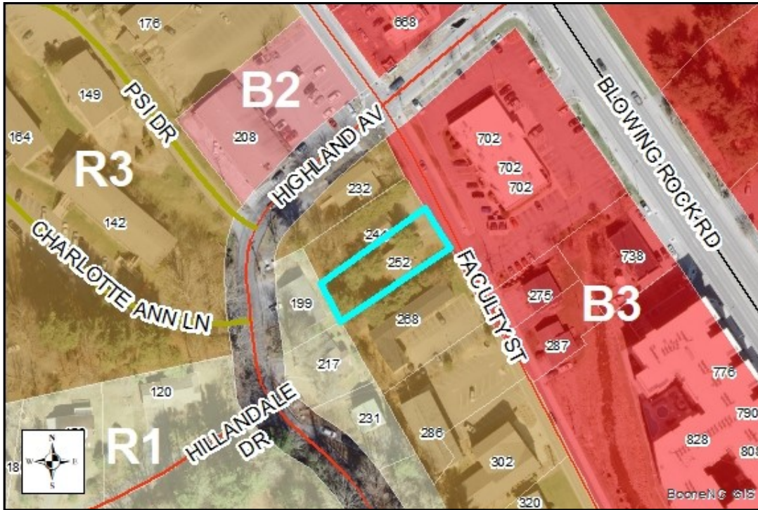
Slope, SFHA, Watershed, Corridor District