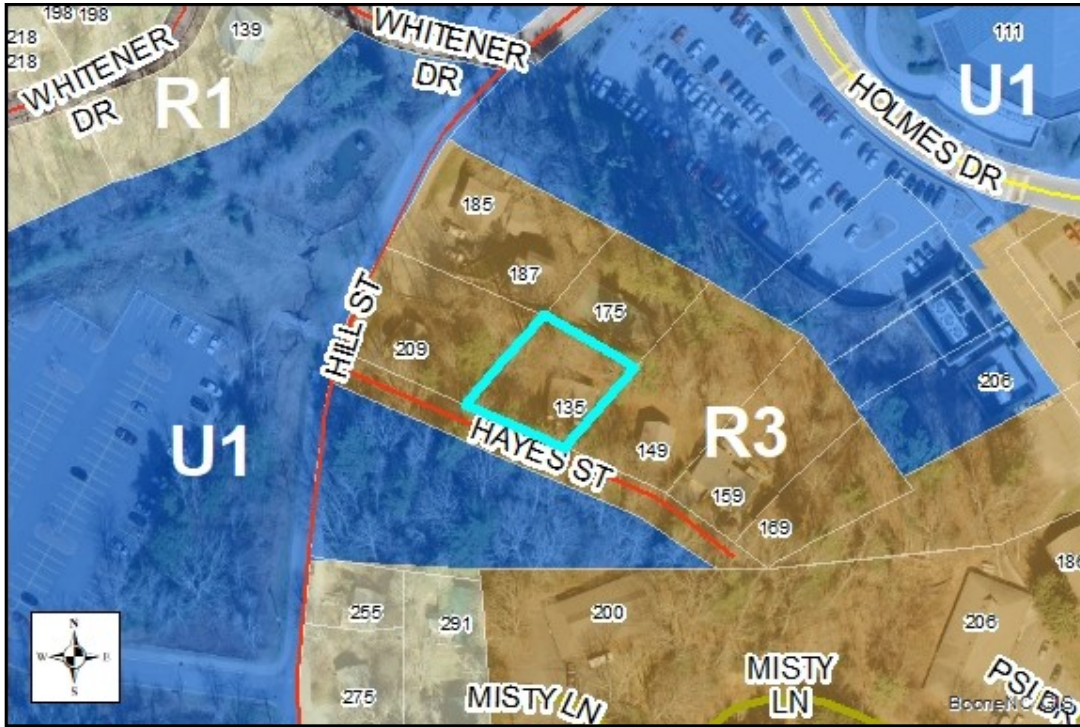
Slope, SFHA, Watershed, Corridor District