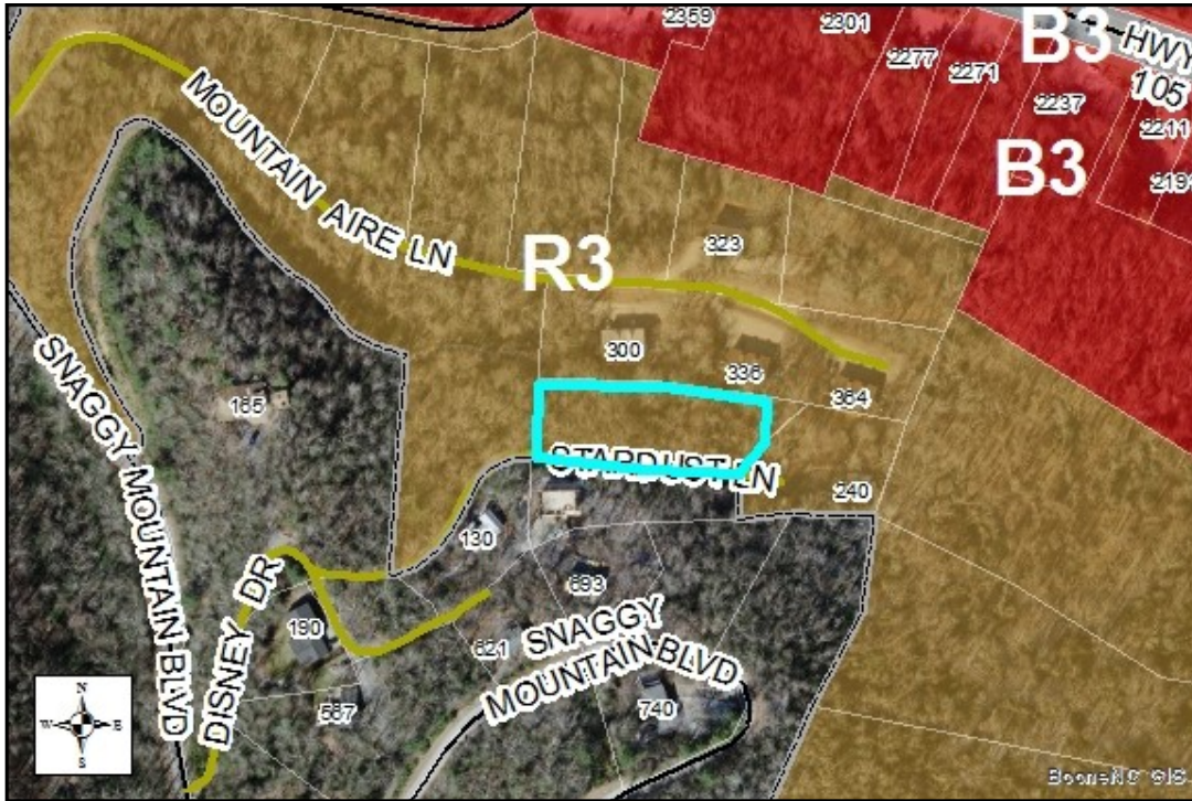
Slope, SFHA, Watershed, Corridor District