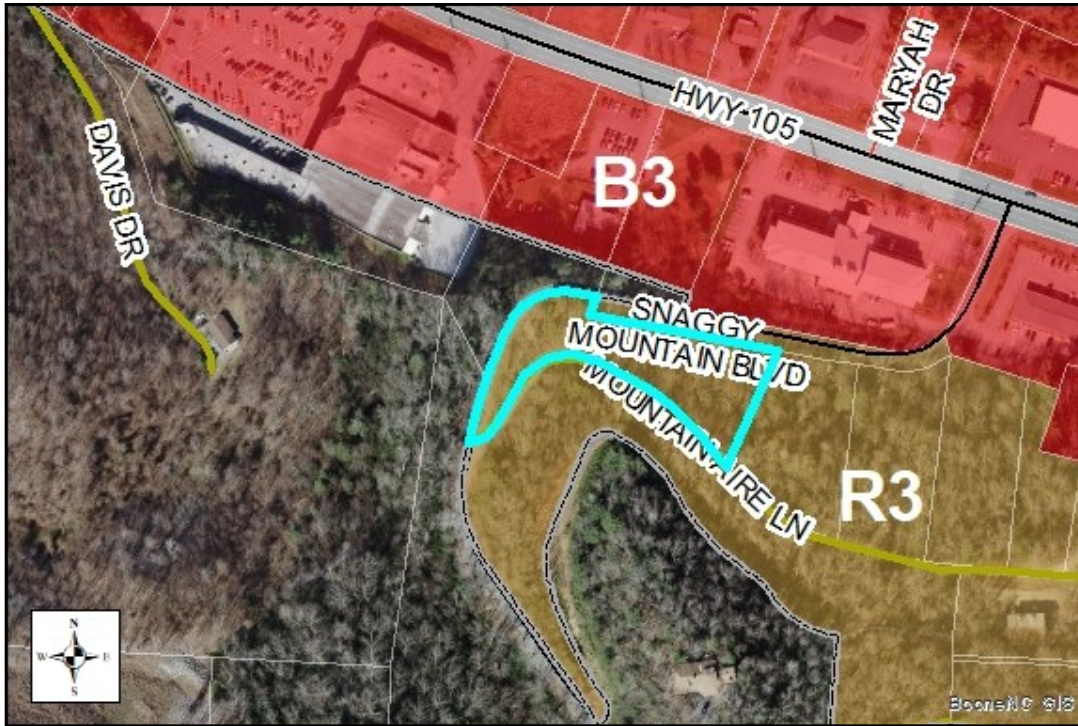
Slope, SFHA, Watershed, Corridor District