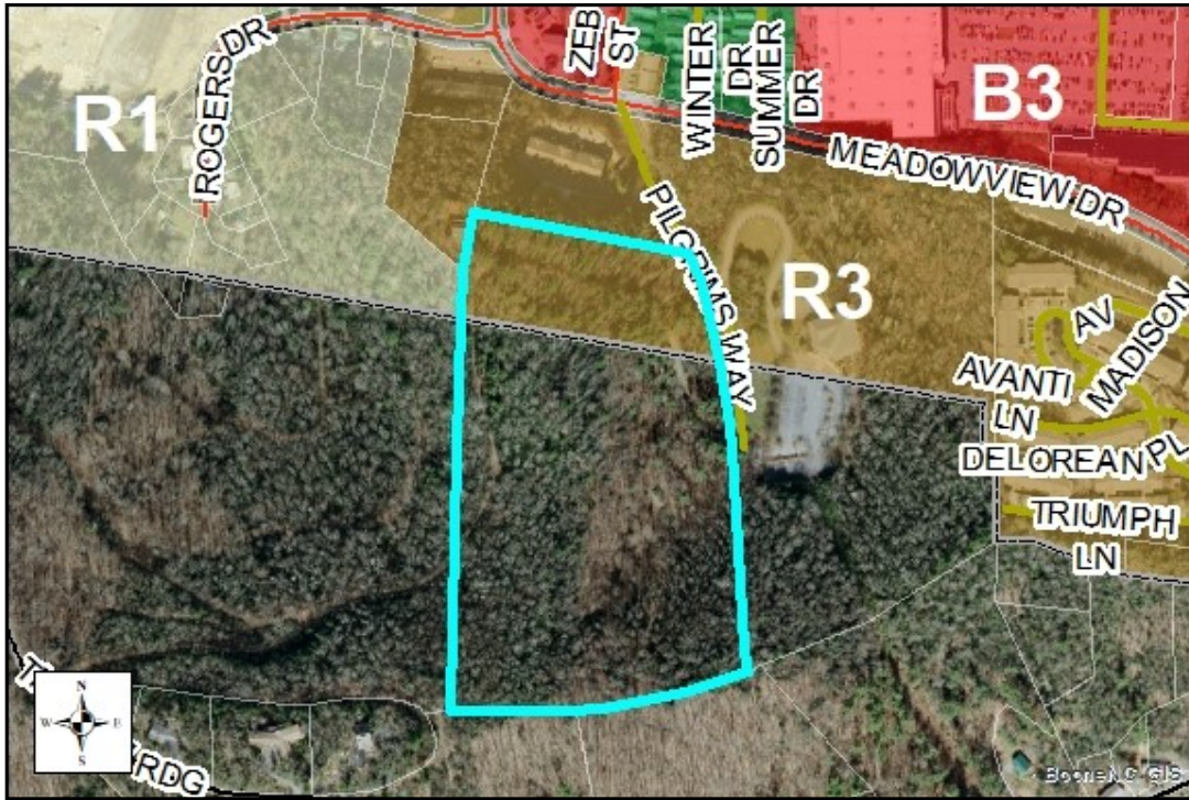
Slope, SFHA, Watershed, Corridor District